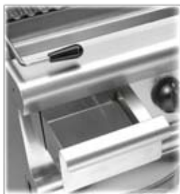
Useful fat collection tray

Modern technology combined with the strength of stainless steel, with a Scotch Brite finish. Sober and elegant lines are the result of aesthetic research focusing on modern criteria in terms of ergonomics and functionality. This is the 'Settecento Baron' series: a professional kitchen, just 70 centimetres deep, that can be manufactured according to your exact requirements, without making any sacrifices and without any limits in terms of its composition. All of this plus the CE mark. Equipment designed and built to guarantee total safety as well as perfect hygiene with the utmost in energy efficiency.